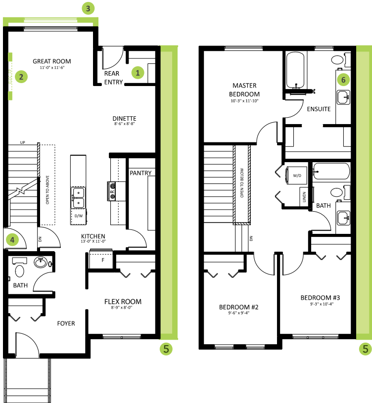
Main Floor 808 SQ FT

Job # WDB-0-034886 Lot 40, Block 3, Plan 172-2010