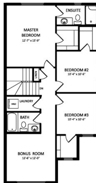
Second Floor 958 SQ FT