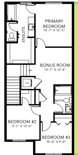
Second Floor 803 SQ FT