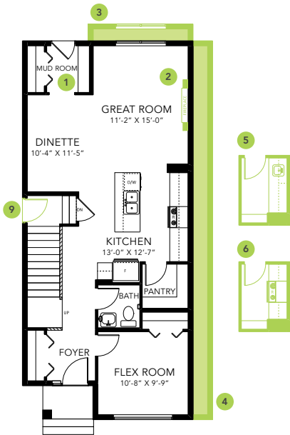
Main Floor 857 SQ FT

Job # ROB -0-034993 Lot 33, Block 11, Plan TBD