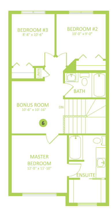
Second Floor 670 SQ FT