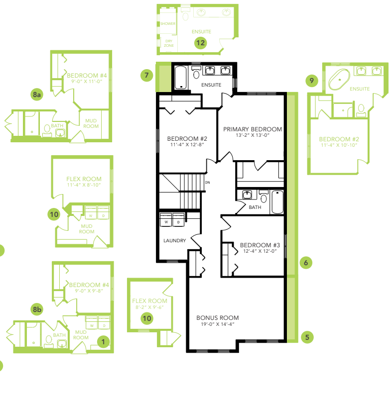
Second Floor 1241 SQ FT