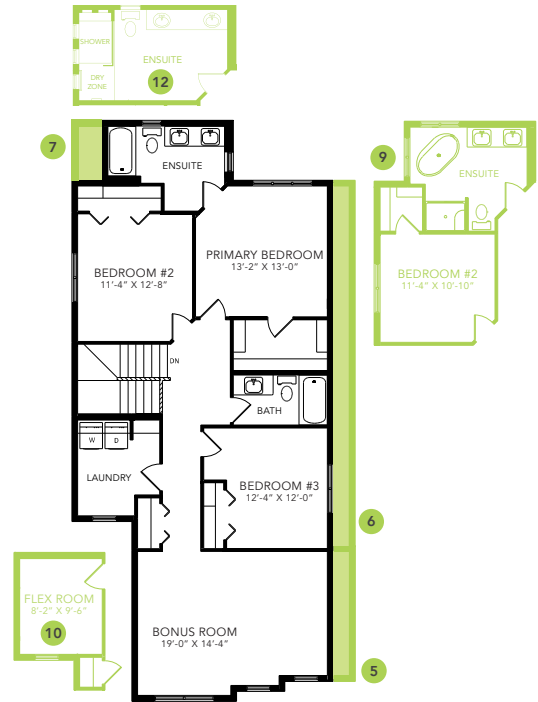
Second Floor 1246 SQ FT