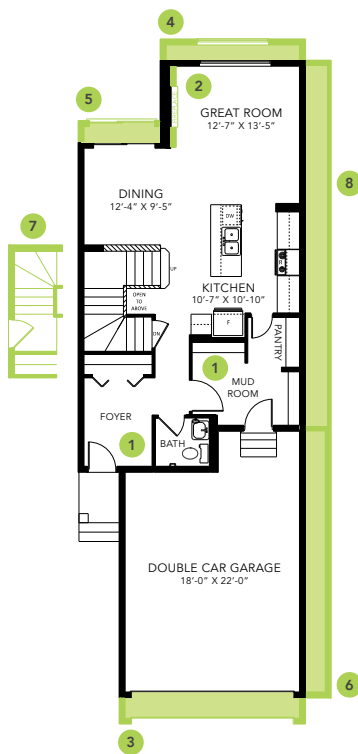
Main Floor 774 SQ FT