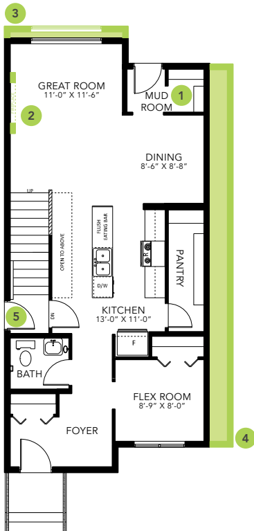
Main Floor 808 SQ FT