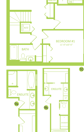
Second Floor 1087 SQ FT