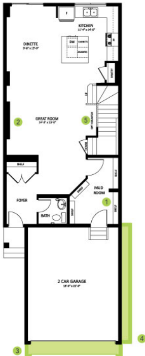
Main Floor 924 SQ FT