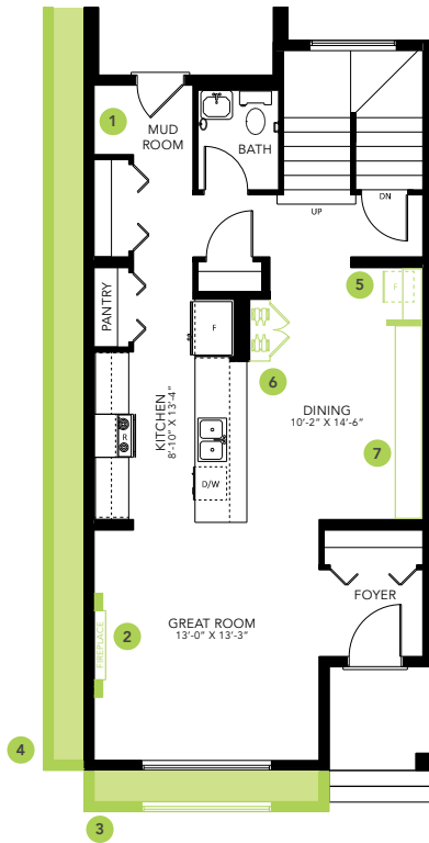
Main Floor 782 SQ FT