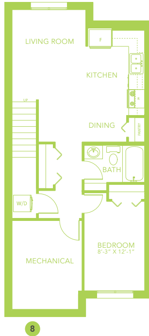
Main Floor 808 SQFT SQ FT