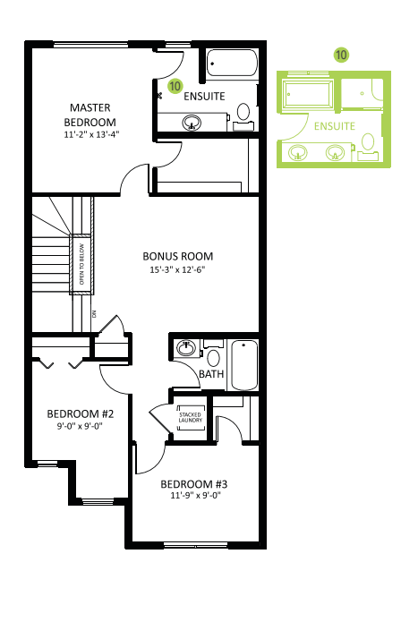
Second Floor 903 SQ FT