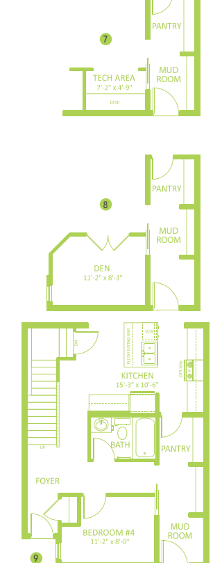
Main Floor 858 SQ FT

Job # CHH-0-034582 Lot 6, Block 16, Plan 192-3068