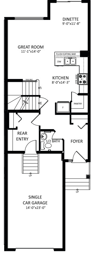
Main Floor 689 SQ FT

Job # CHH-0-034300 Lot 12, Block 9, Plan 172-3655